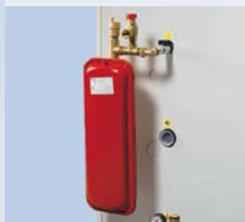
Pressurised fill kit

This kit, available from model 015, is used in pressurised water circuit applications (up to 6bar g ). The kit features all components required for safe and easy operation, including a pressure reducer, water inlet valve, pressure gauge, automatic relief valve, safety valve and expansion tank.